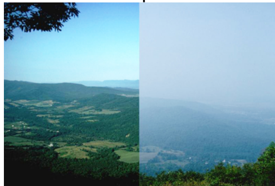
Regional haze from pollution in Washington

*Help the planet : For every 10 minutes of idling you prevent, you can save one pound of carbon dioxide, a harmful greenhouse gas, from being released into the atmosphere.